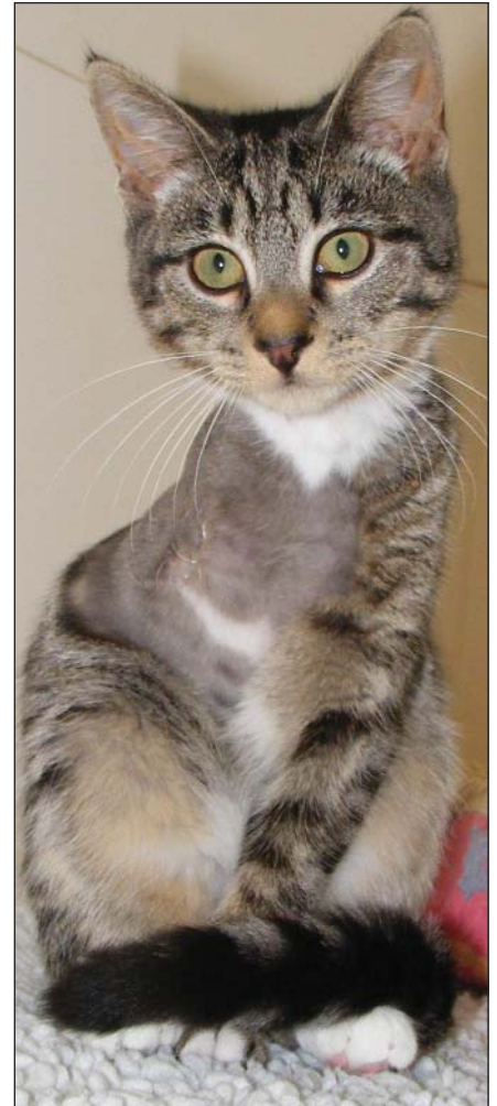
Albus after his operation

If you would like to make a donation towards the appeal, please call Rebecca on 0117 3003968, text CARE26 and the amount (ie, CARE26 £5) to 70070 or you can make a secure on-line donation at www.justgiving.com/ICUAppeal .