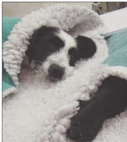
Vet bed in use